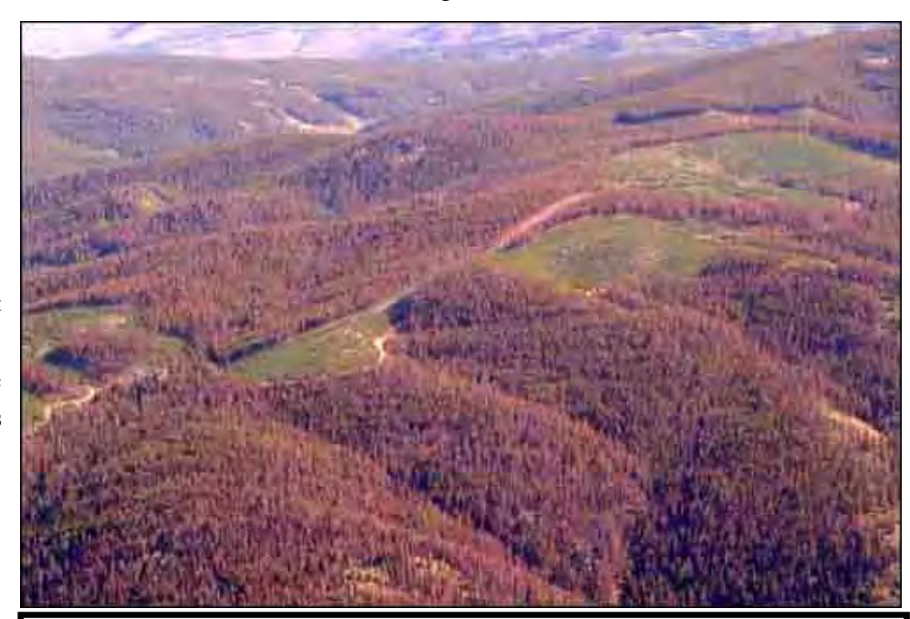
Many forests in Wyoming are over 80% dead, with the only living stands of trees being those planted in clearcuts.

If forests in Wyoming are to become healthy and resilient again, forest management must include comprehensive management planning. Plans should include site specific treatments to address all issues and concerns associated with the ecosystem. In some instances forest management may be accomplished by wildfires that are allowed to burn in the re-