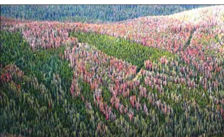
Mountain pine beetle is marching across many of our forests in Wyoming, leaving red trees in its wake.

Old Mother Nature has been busy recently, turning many forests in Wyoming red. Forests that have not been killed by bark beetles are now being threatened by beetle infestation. Healthy forests adjacent to beetle-killed areas are often threatened by wildfire. As areas of beetle-kill increase fuel loading over time, the potential for intense wildfires across entire landscapes greatly increases. As fire intensity increases so does the severity and size of these fires resulting in dramatically escalating financial commitments and loss of values.