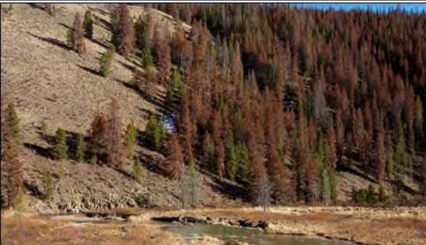
Over half of the water in Wyoming originates from our high elevation forests. How will the beetle epidemic affect our water supply?

The decline in the health of our forests has not occurred overnight. The problem has been developing over a long period. The current beetle epidemic is one symptom of this decline. The drought over the last 10-15 years, and some say climate change over a much longer period, have contributed to forest health problems. Drought and climate change should not receive all the blame, however. Forests have experienced long periods of warm and dry weather in the past. A more likely contributor to the problem has been we the people. Humans have contributed far more to the loss of the forests through our improper or, in many cases, complete absence of forest management.