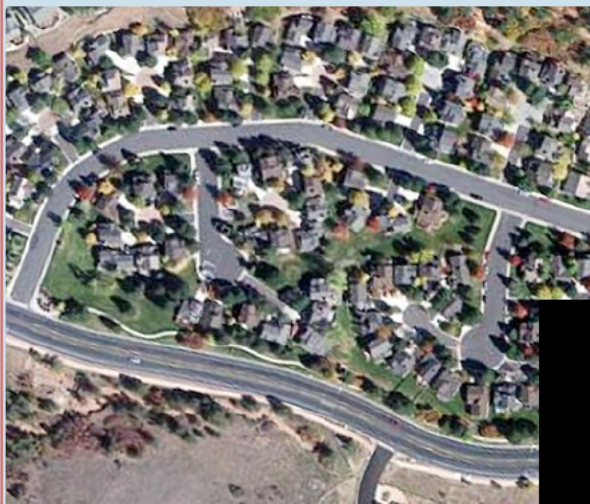
A NORTHERN COLORADO NEIGHBORHOOD

The good news is that most of the Bighorn Basin hasn't made the news for these activities.